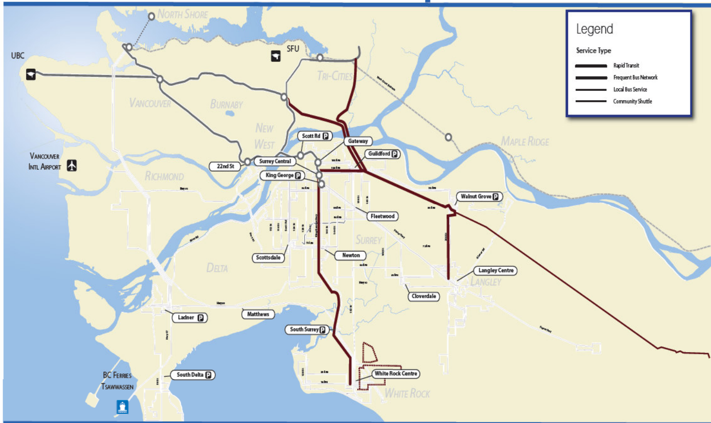
Figure 7: 2013 Improvements