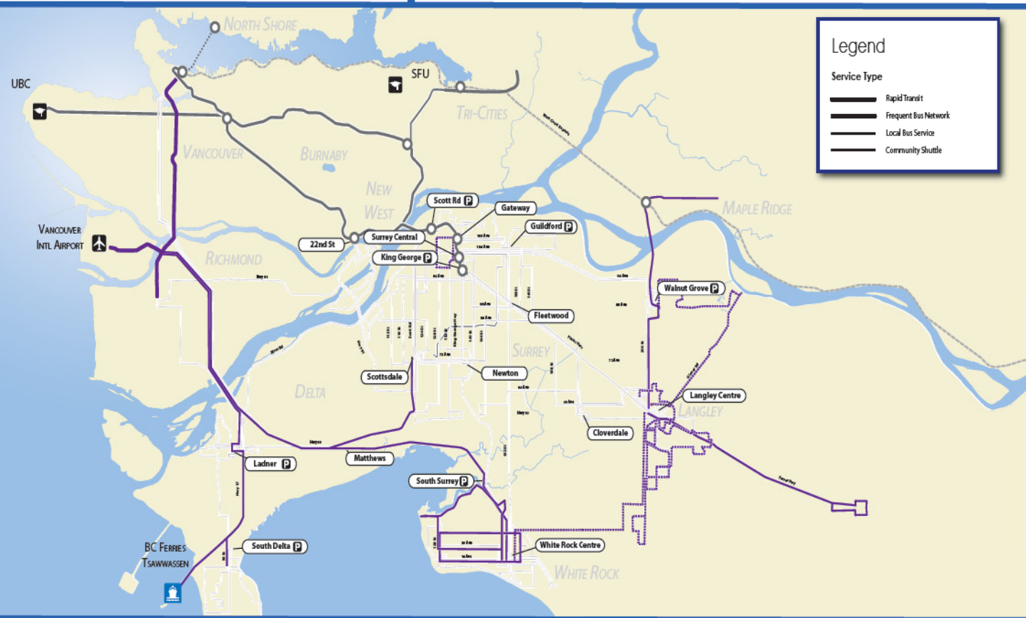
Figure 5: 2009 Improvements