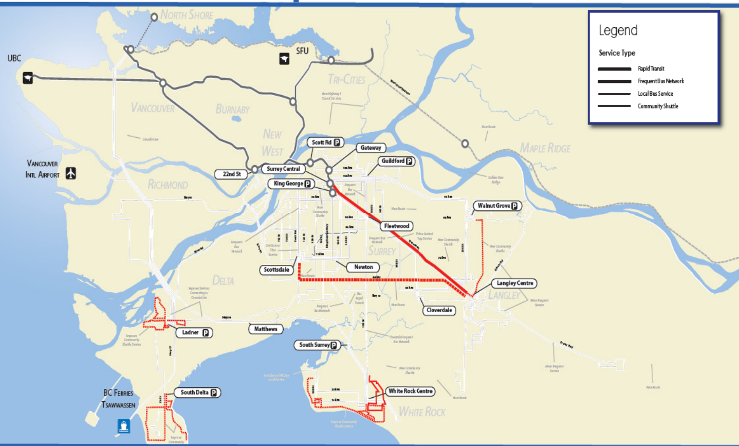
Figure 6: 2012 Improvements