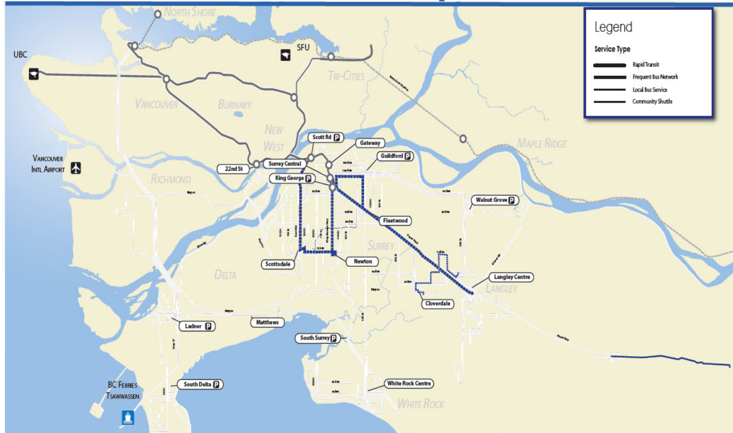
Figure 3: 2007 Improvements