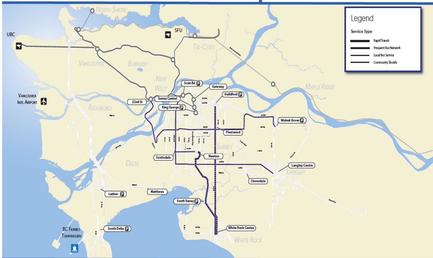
Figure 4: 2008 Improvements